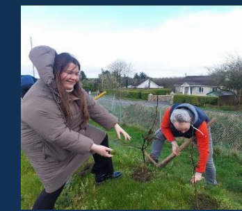
Volunteers Hard at Work