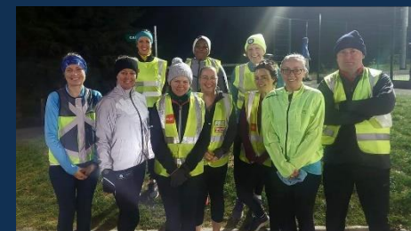
Some of our adult members at our twice weekly 'Drop & Run'