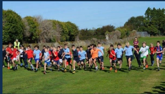
Bandon AC organised Primary Schools Sports