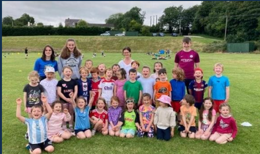
One group of participants in Bandon AC Summer Camp with Volunteer Coaches